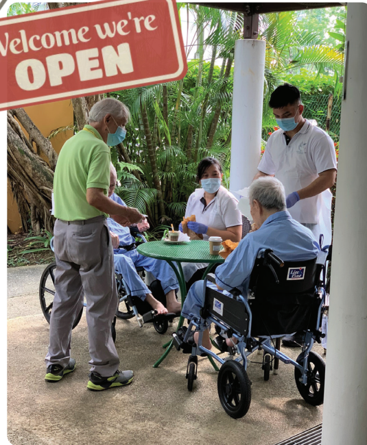
Project Lim Kopi activity photo