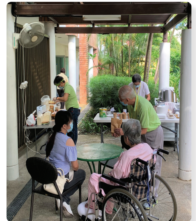
Project Lim Kopi activity photo